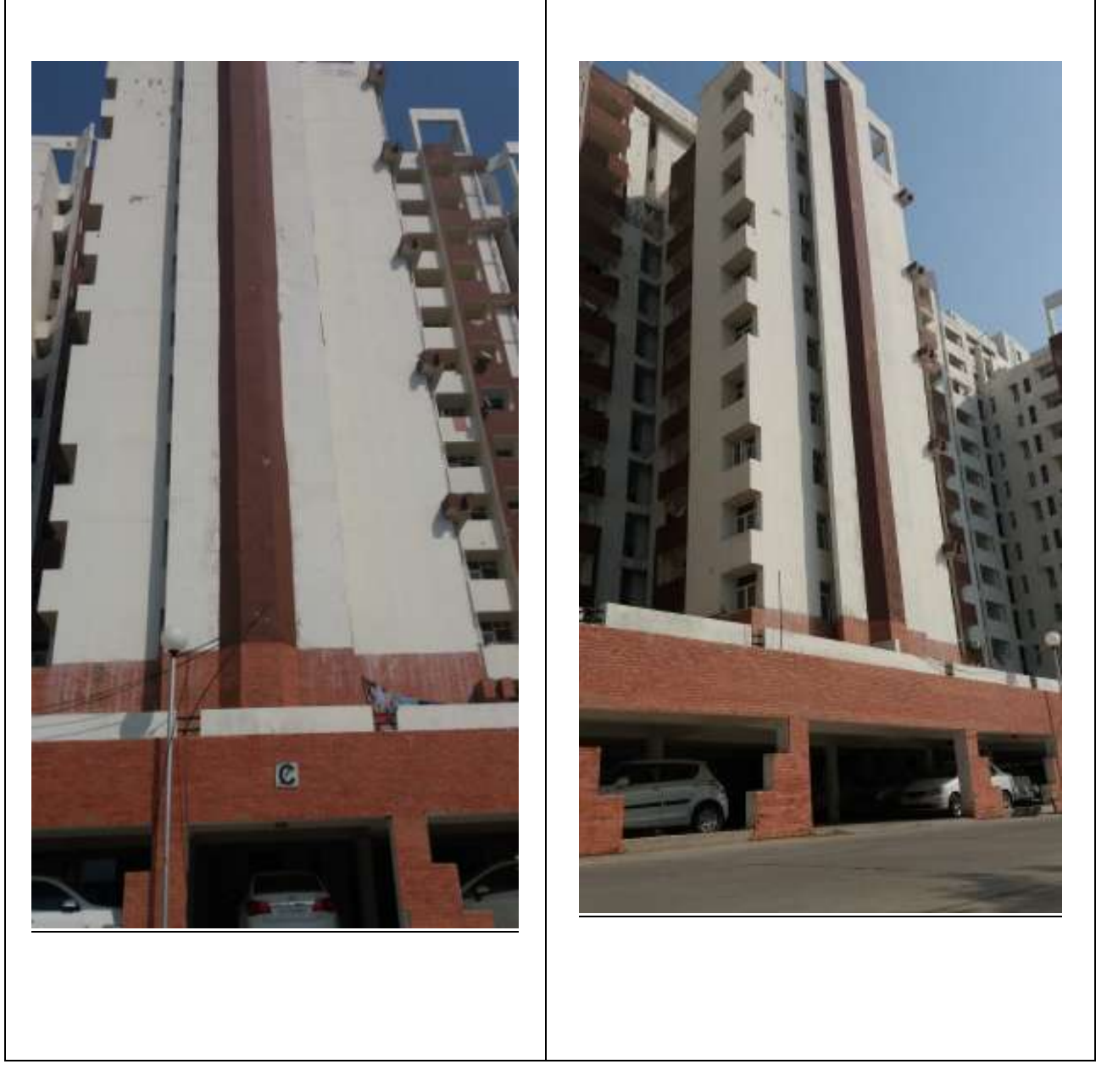
<u>Tower 'C'</u> Work completed in Totality