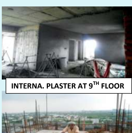
REINF. STEEL BINDING OF M/C