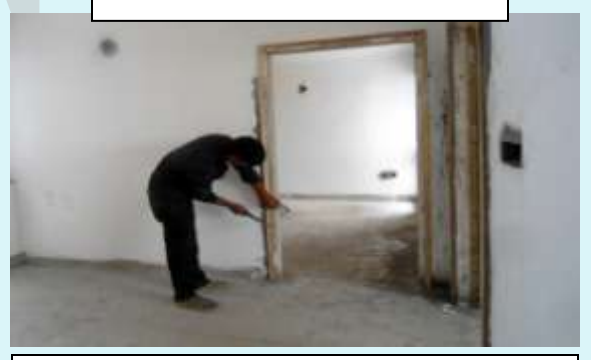
FIXING OF MOULDING ON DOOR FRAMES

TOWER-6 (TYPE A-2) (Overall completion 87.25 %)