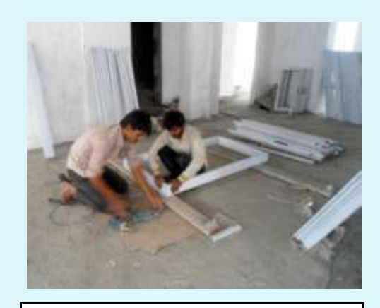
MAKING OF ALUMINUM MAIN FRAMES