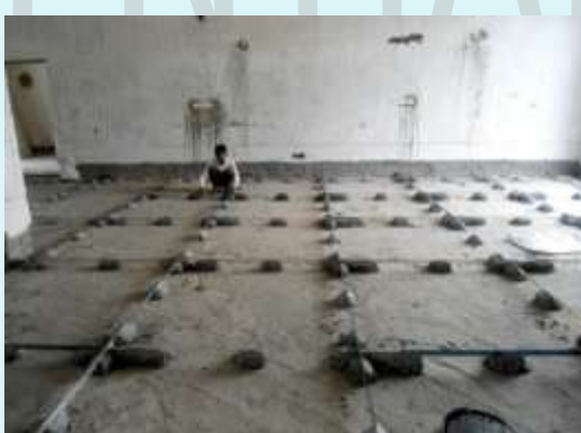
CC FLOORING IN GYMNASIUM

COMMUNITY CENTRE - (Overall completion 92.50 %)