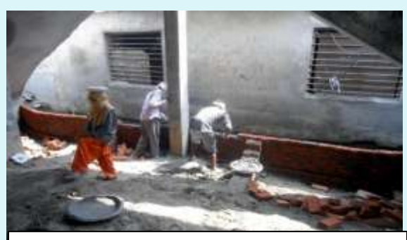
BRICK WORK BELOW STAIRCASE AT STILT