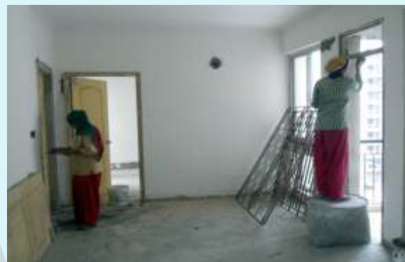
PUTTY ON DOOR FRAMES