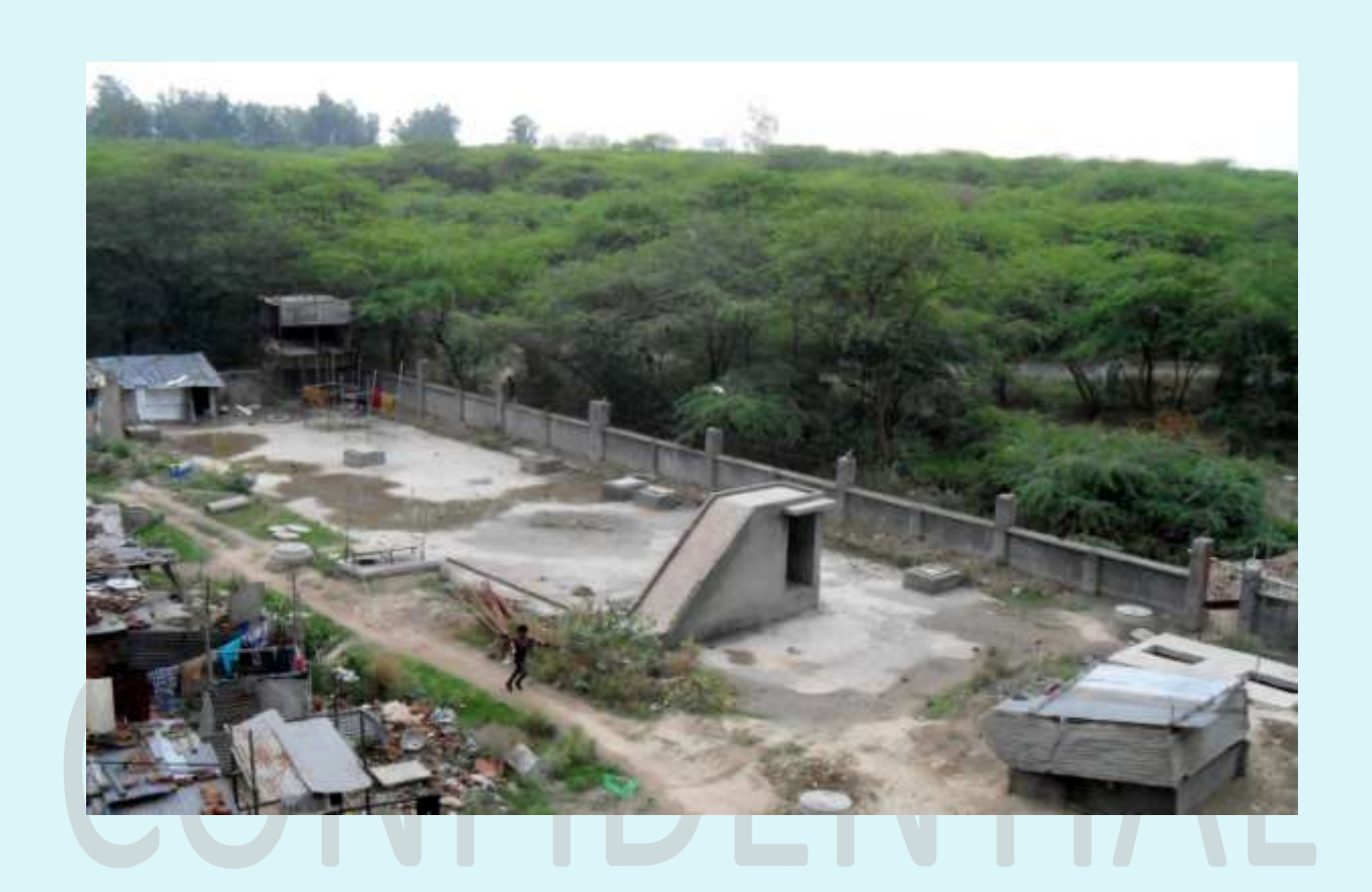
STP - (Overall completion 37.26 %)