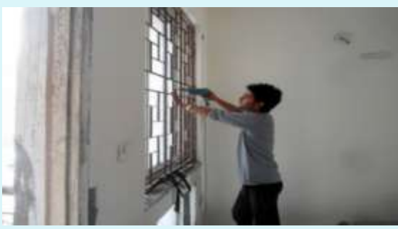
LOCK FIXING IN ALUMINUM WINDOWS