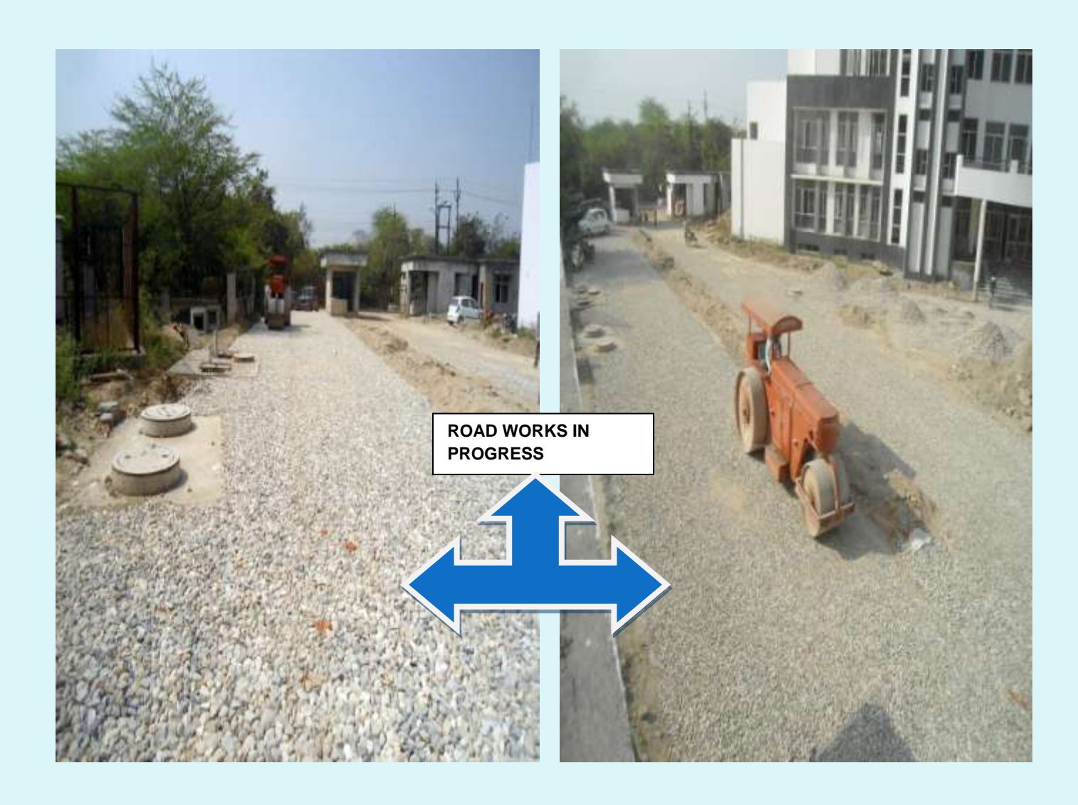
Gate No. 1 - (Overall completion 90.00 %)