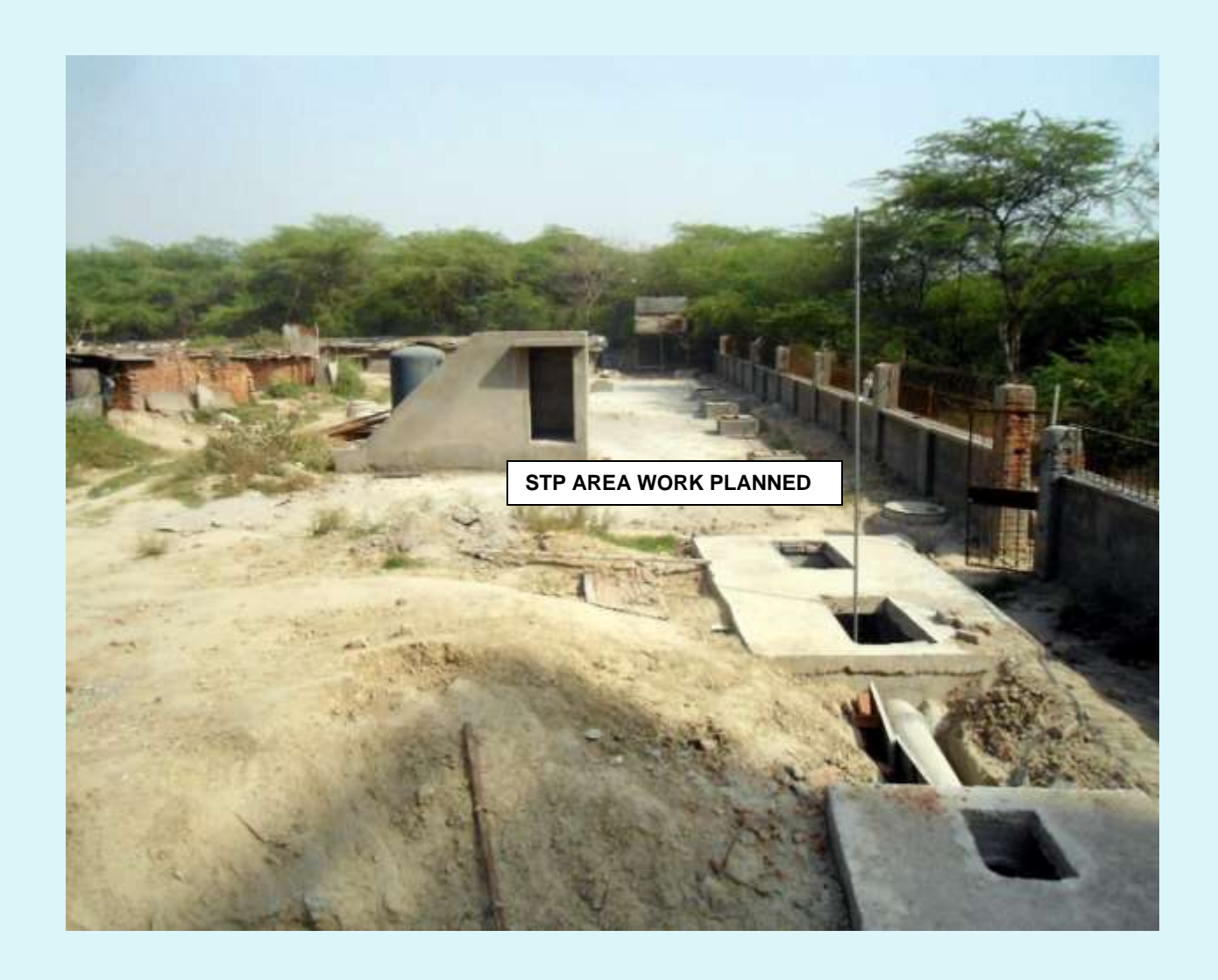
STP - (Overall completion 37.26 %)