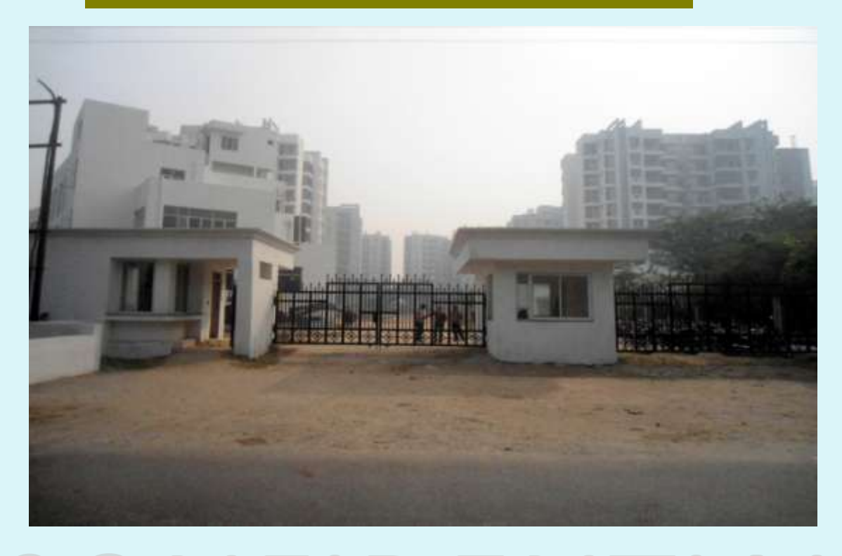
MAIN GATE & BOUNDARY WALL - 70 % WORK IS COMPLETED