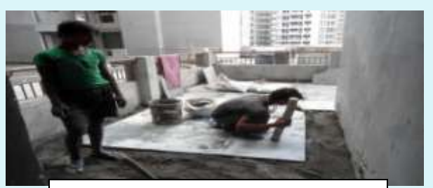
FIXING OF KOTA STONE AT PODIUM