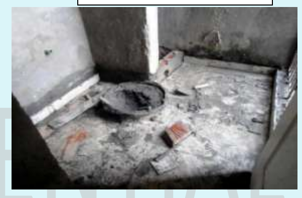
FIXING OF VITRIFIED TILES IN BALCONY

TOWER- 8 (TYPE B-1 & TYPE B2) (Overall completion 88.50 %)