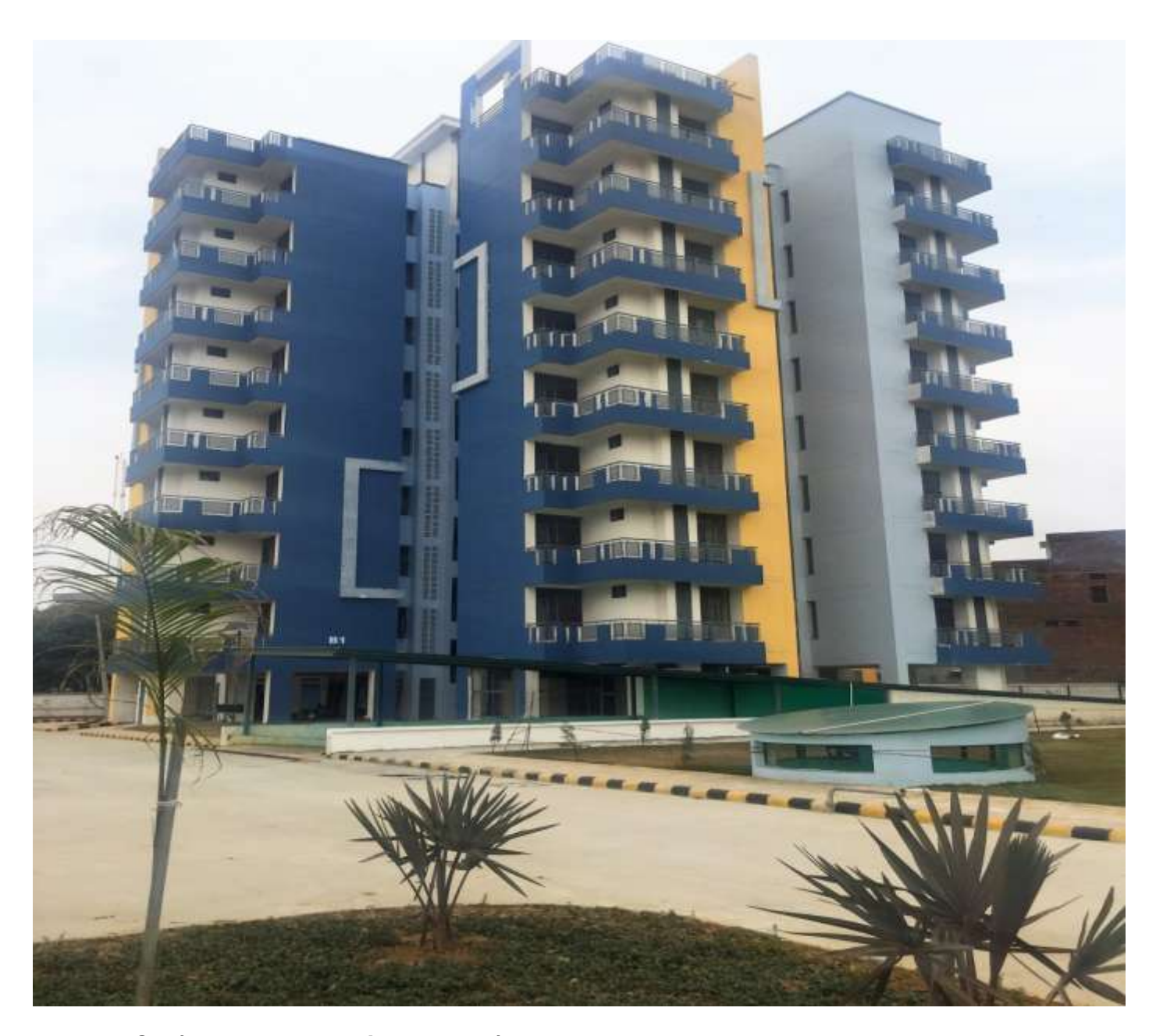
B1- BLOCK (overall completion 99.75%)