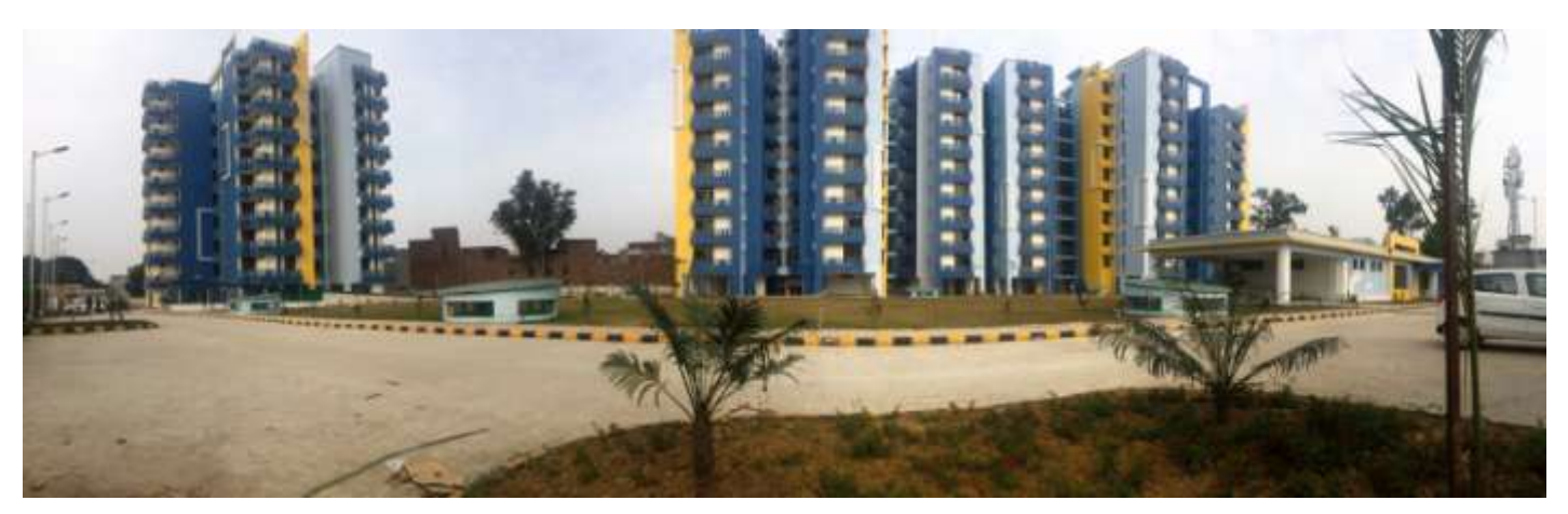
PANORAMIC VIEW OF AFNHB JALANDHAR PROJECT