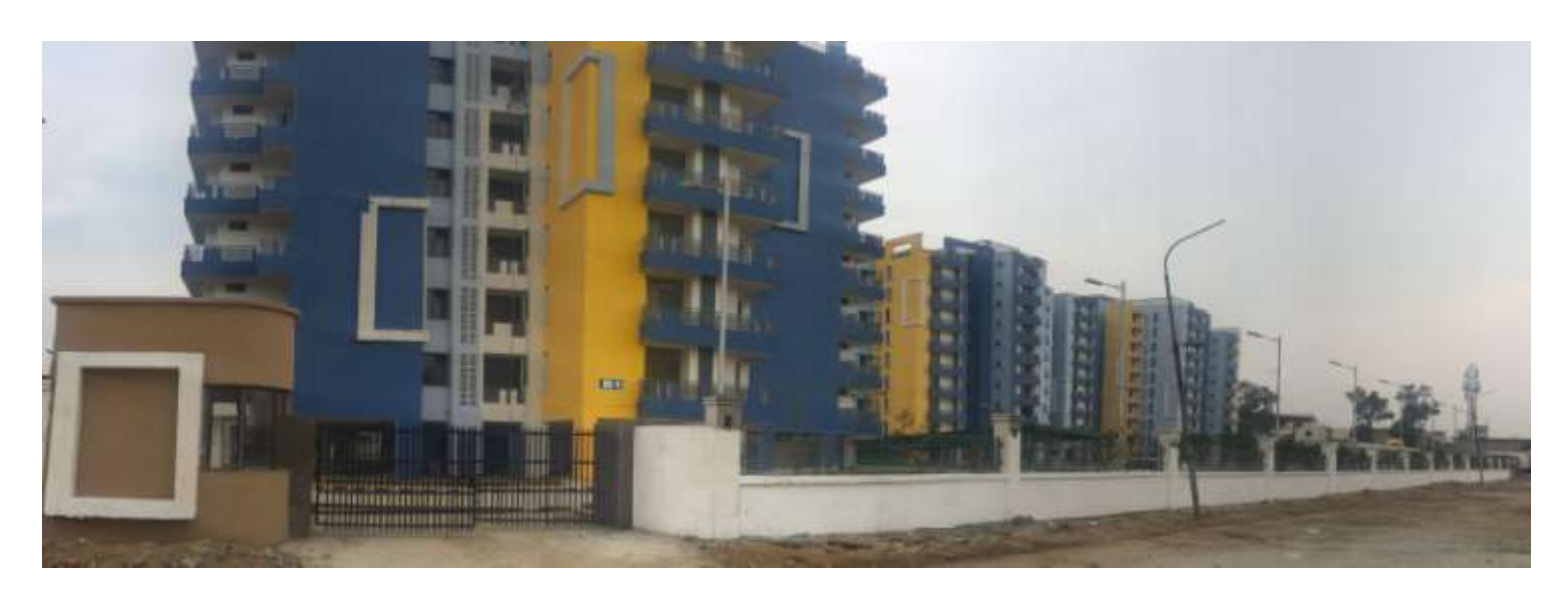
VIEW OF MAIN ENTRANCE GATE

Labour camps in front of site removed, Road cleared