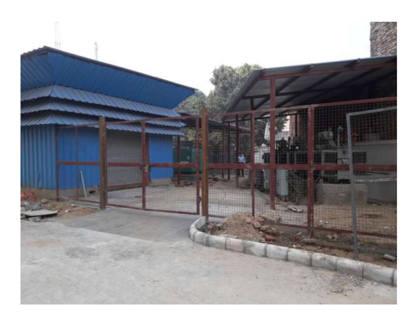
ELECTRICAL SUB STATION SUBSTATION ENERGIZED