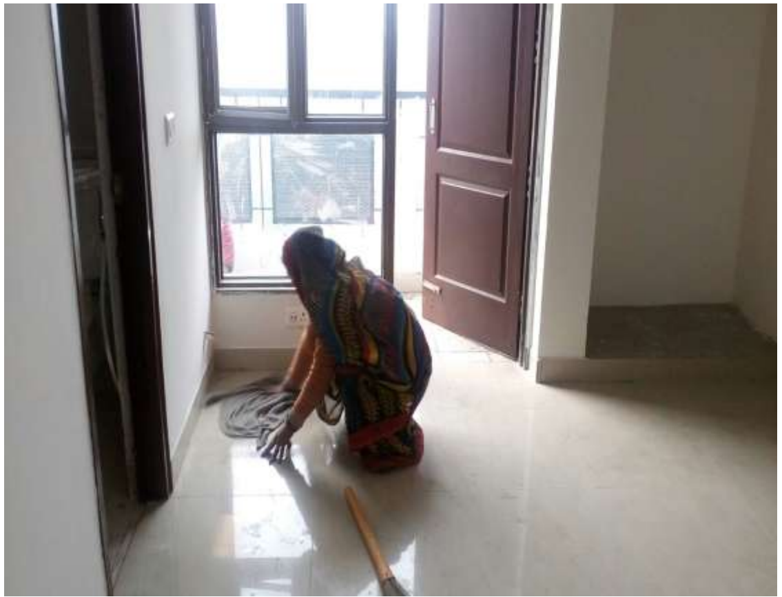
CLEANING WORK IN PROGRESS