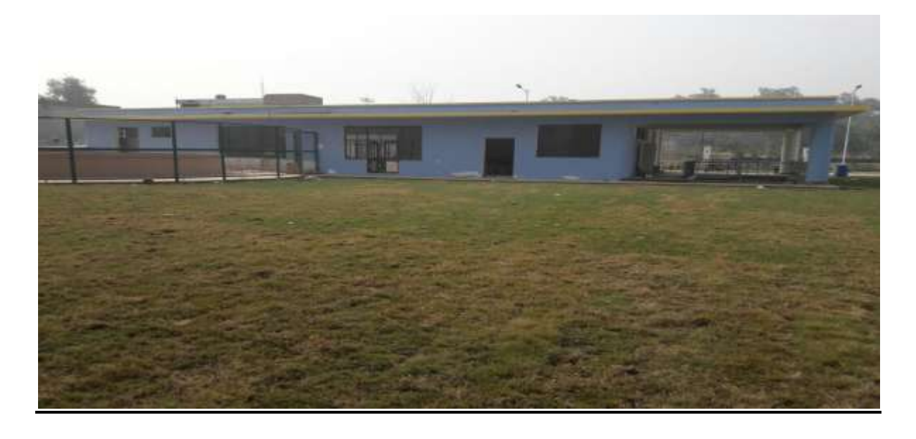
LANDSCAPING WORK IN PROGRESS