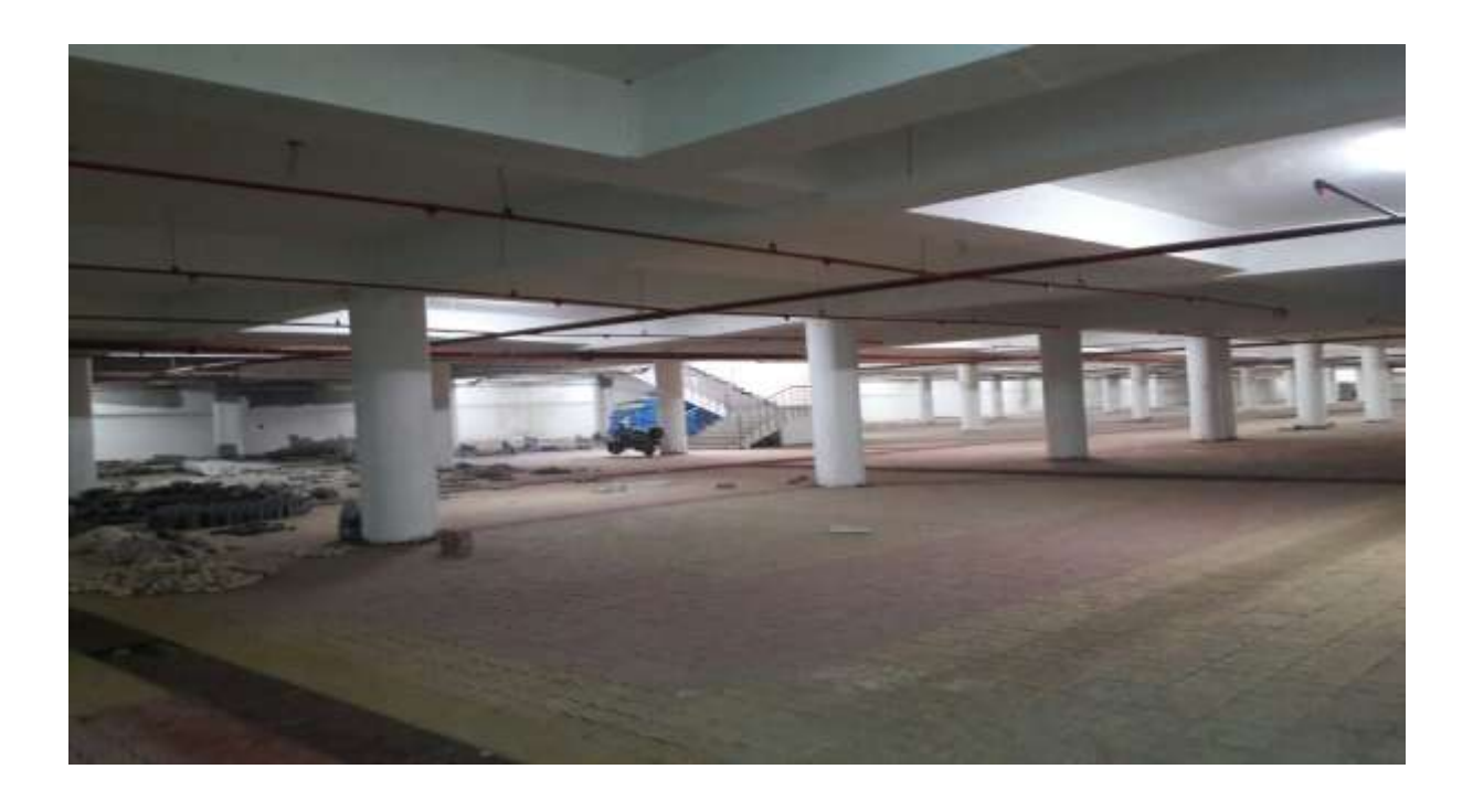
Basement Parking- Progress 99% (House keeping in Progress)