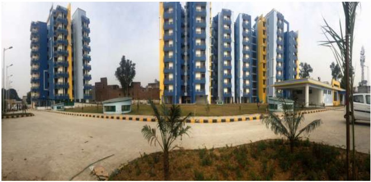
PANORAMIC VIEW OF AFNHB JALANDHAR PROJECT