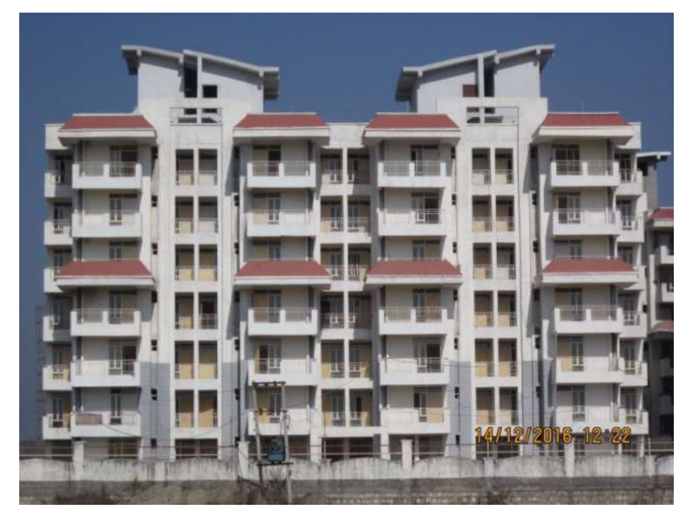
TOWER NO: B2/2 (overall completion 94.5%)