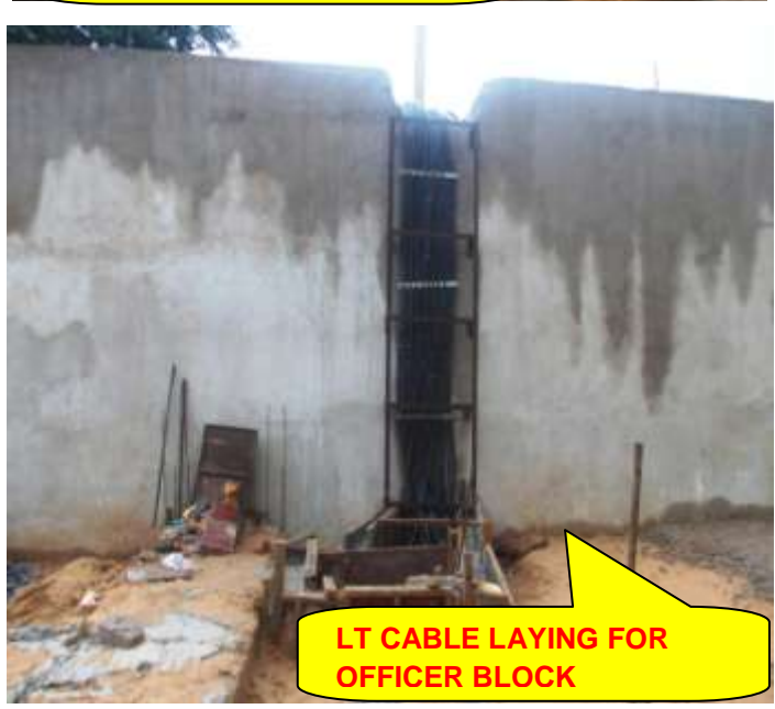
EXTERNAL ELECTRICAL (PART-B) - (Overall completion- 59.5%)