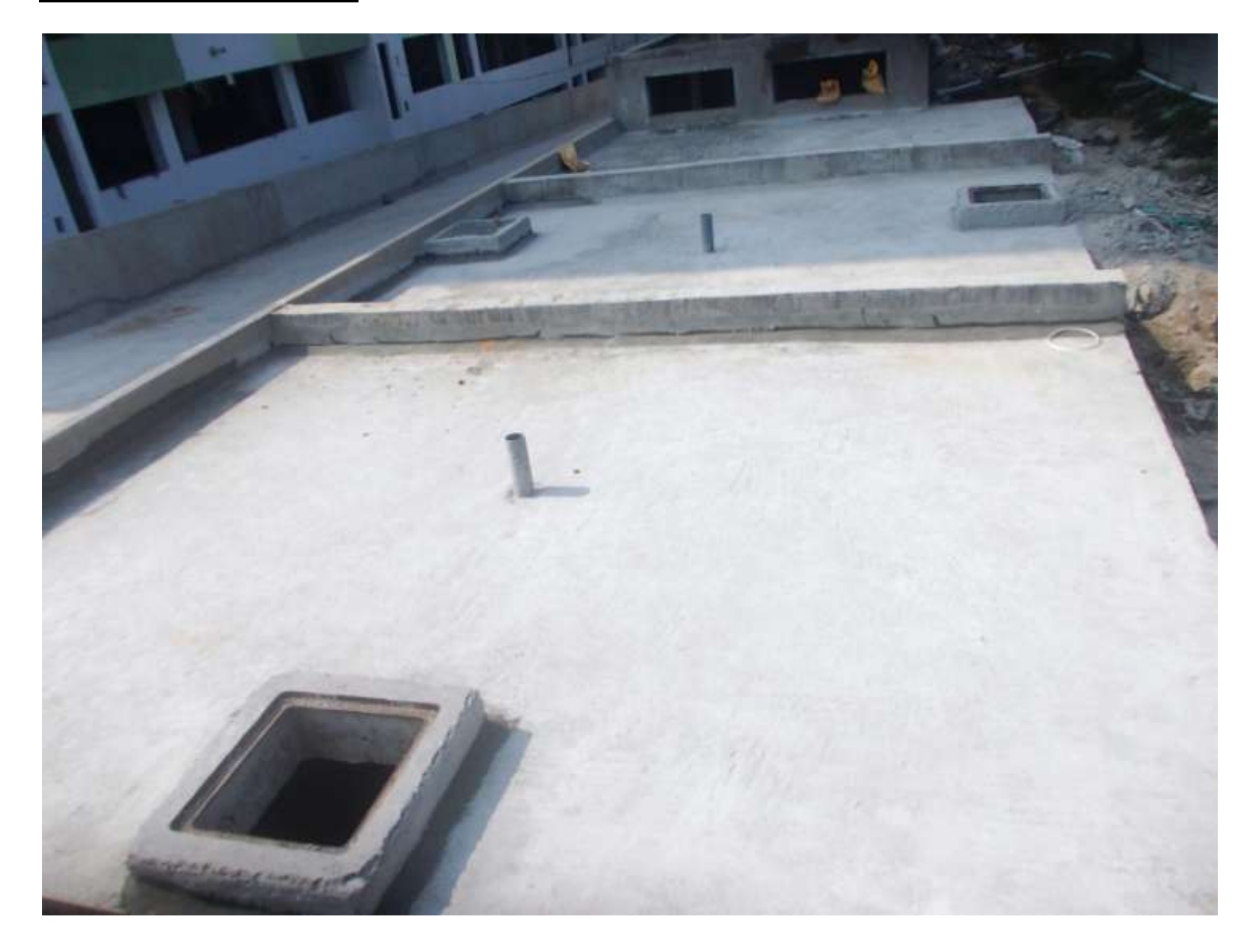
UNDER GROUND RESERVOIR - (Overall completion-53.68%)

PROGRESS: Manhole cover fixing completed.