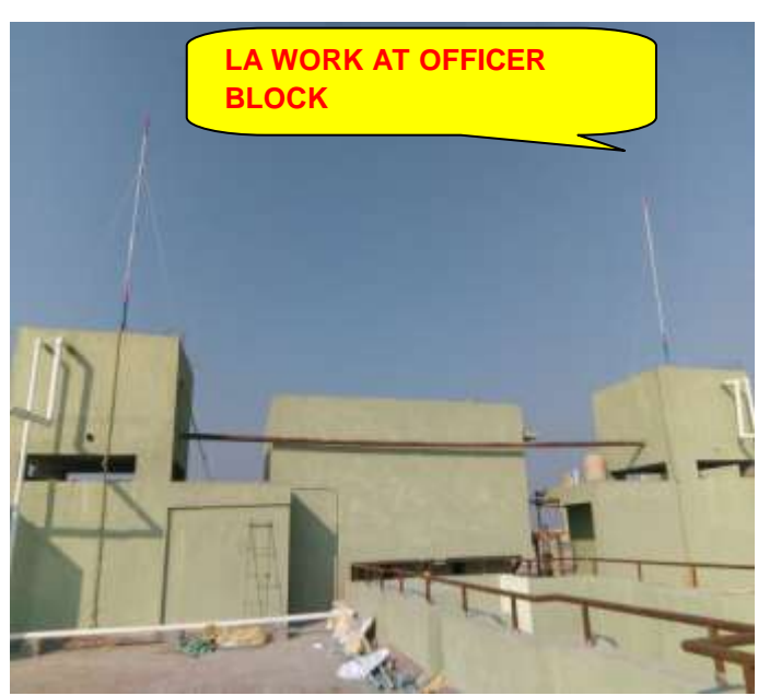
EXTERNAL ELECTRICAL (PART-B) - (Overall completion- 65%)