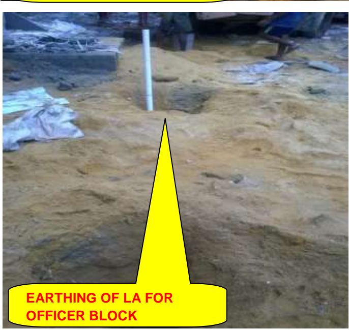
EXTERNAL ELECTRICAL (PART-B) - (Overall completion- 61%)