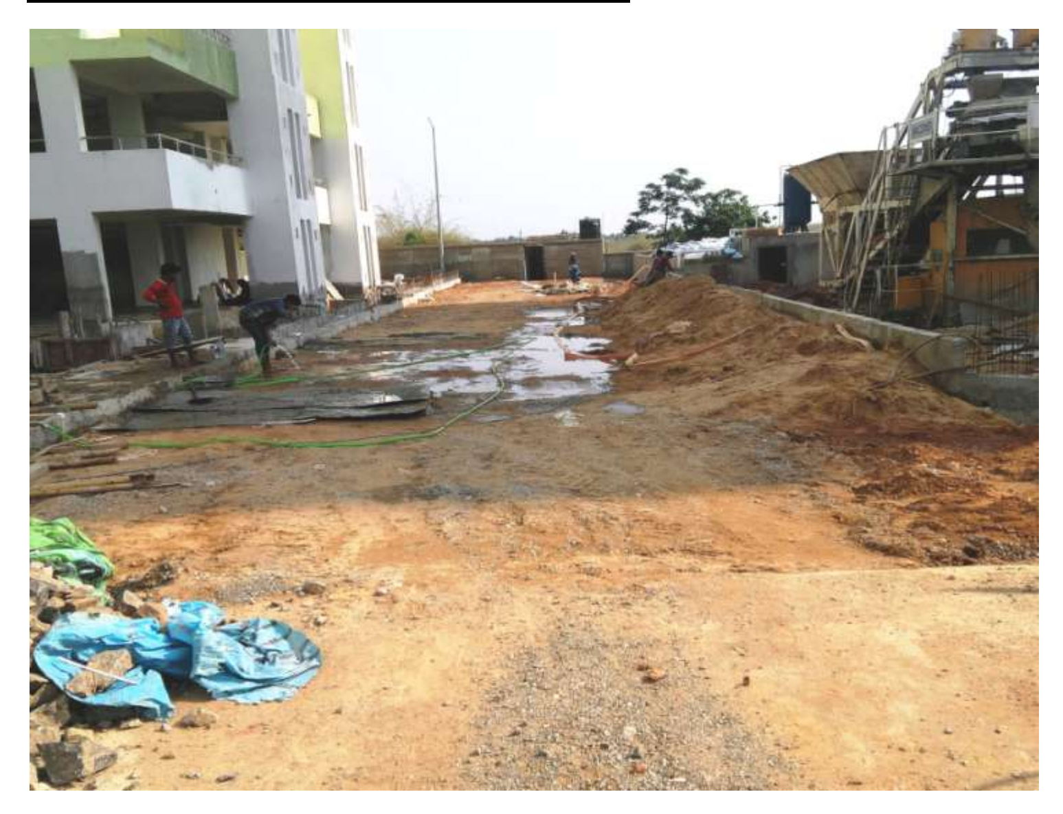
EXTERNAL ROAD & RETAINING WALL WORK (Overall completion-88%)