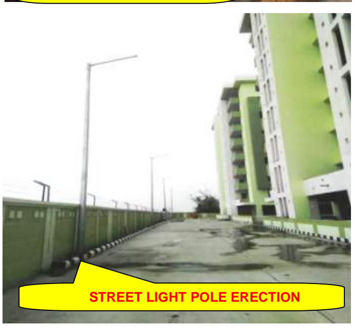
EXTERNAL ELECTRICAL (PART-B) - (Overall completion- 83%)