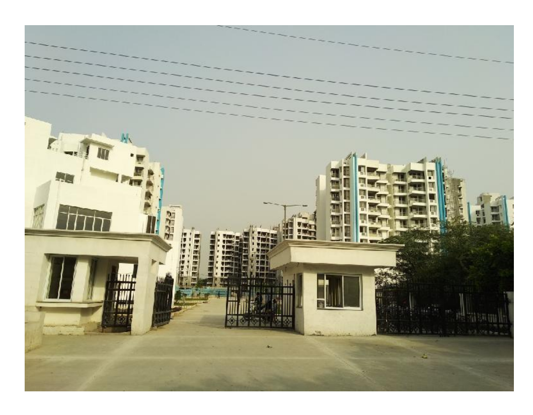
MAIN GATE & BOUNDARY WALL - 80.15 % WORK IS COMPLETED