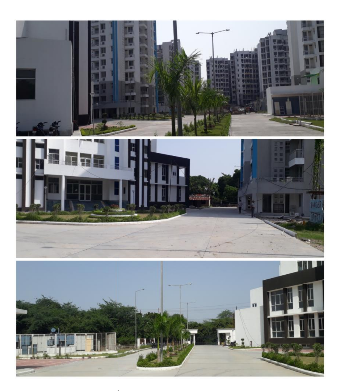
ROAD WORK - 50.68 % COMPLETED.