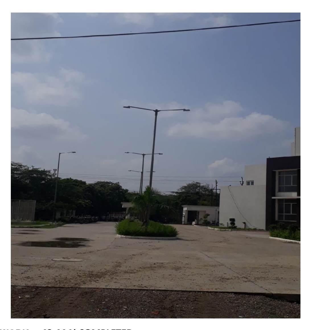
ROAD WORK - 43.44 % COMPLETED.