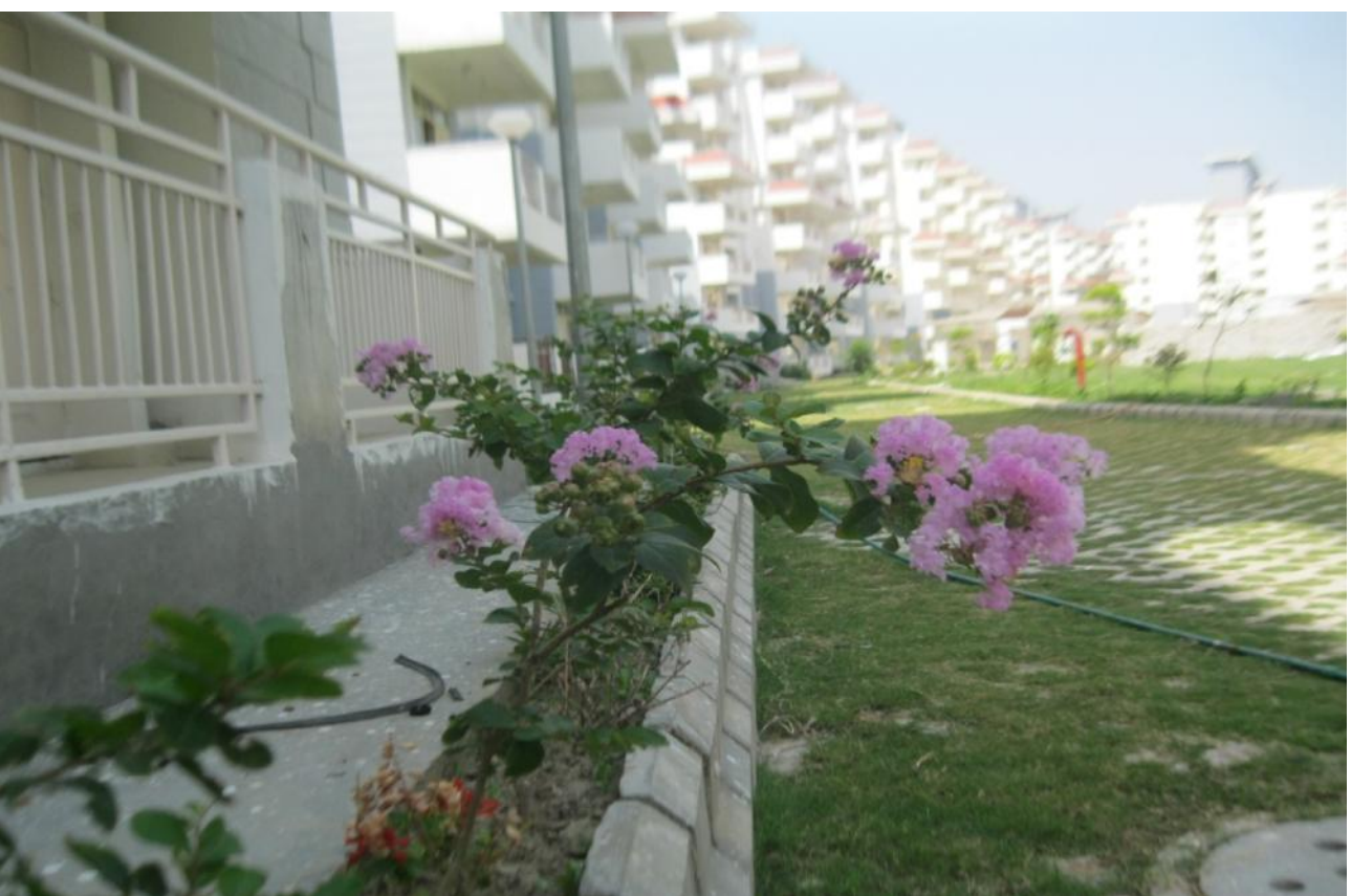
<u>Progress:-</u> Arbotriculture work is in progress. Work of Package-I is completed and handed over to AFNHB.

Repairing work due to laying of GI pipe line is in progress. 40% work is completed in Package-II and remaining work in progress PDC for handing over is 31 Jul 18.