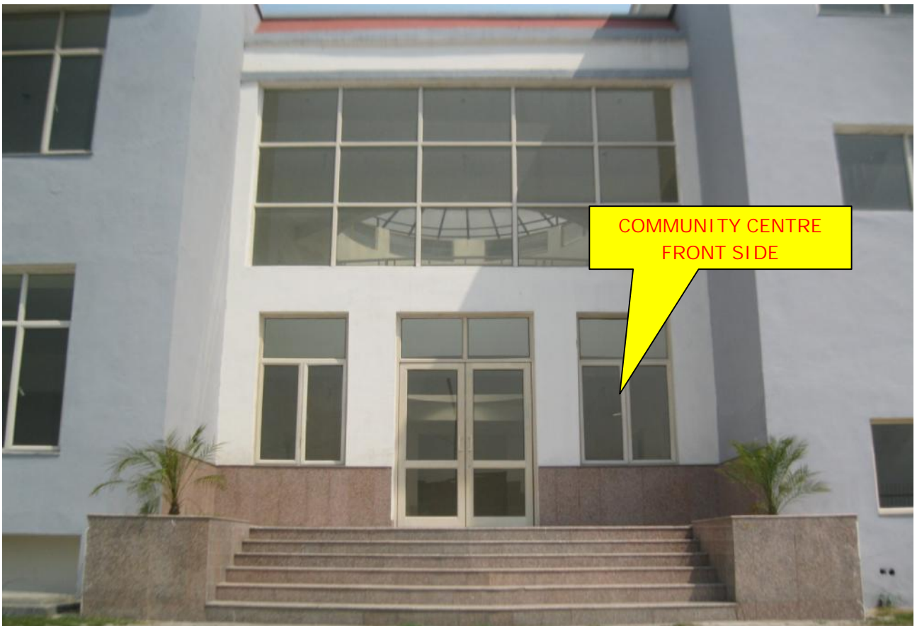
COMMUNITY CENTRE FRONT SIDE