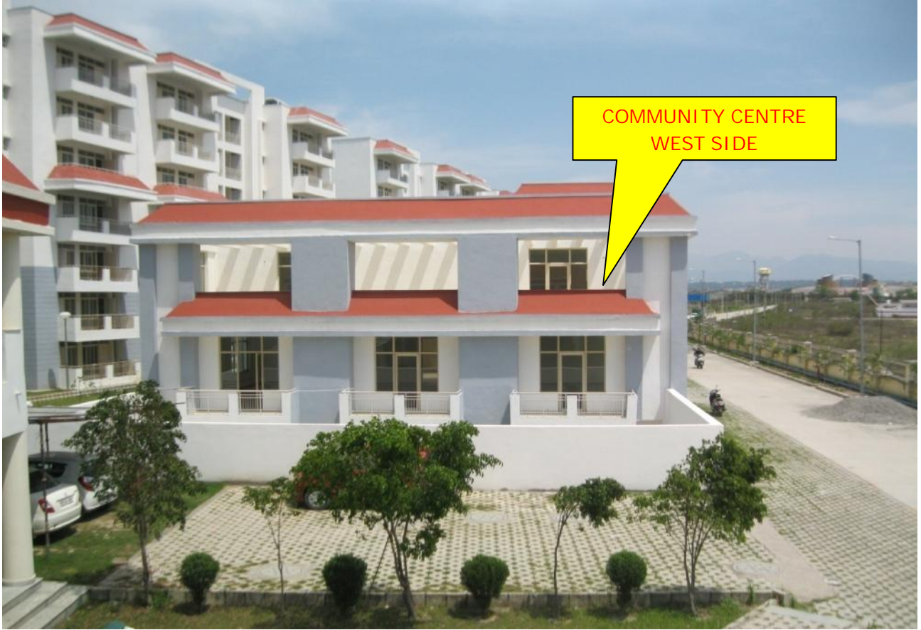
COMMUNITY CENTRE WEST SIDE