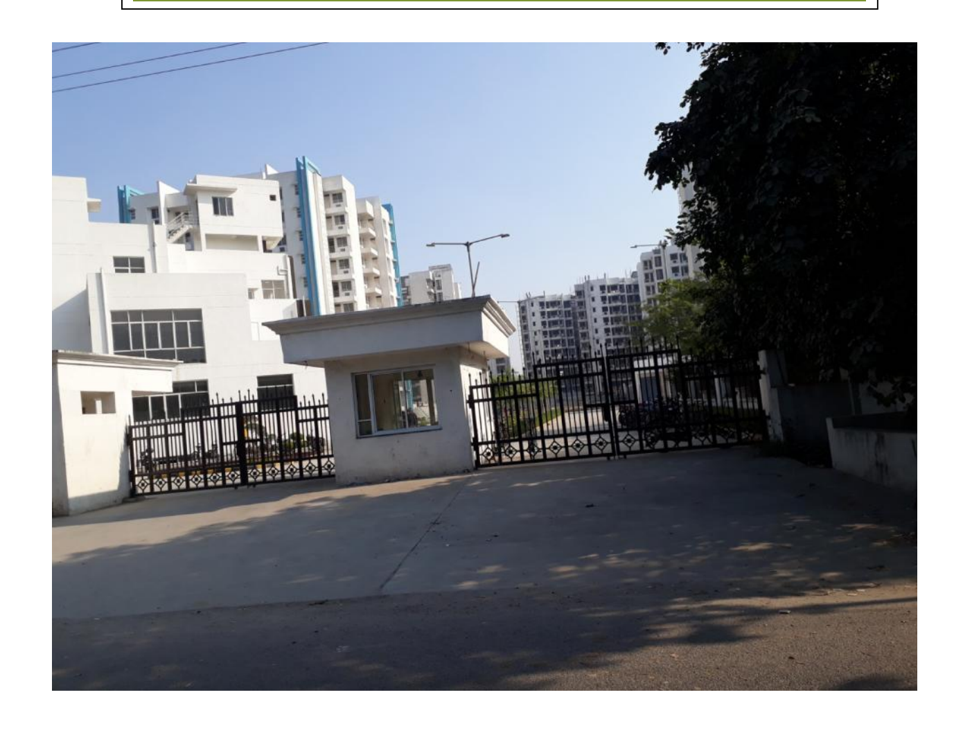
MAIN GATE & BOUNDARY WALL - 80.15 % WORK IS COMPLETED