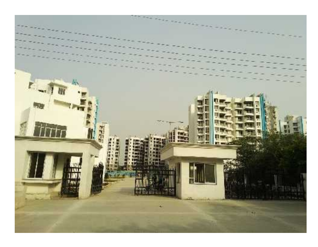
MAIN GATE & BOUNDARY WALL - 80.15 % WORK IS COMPLETED