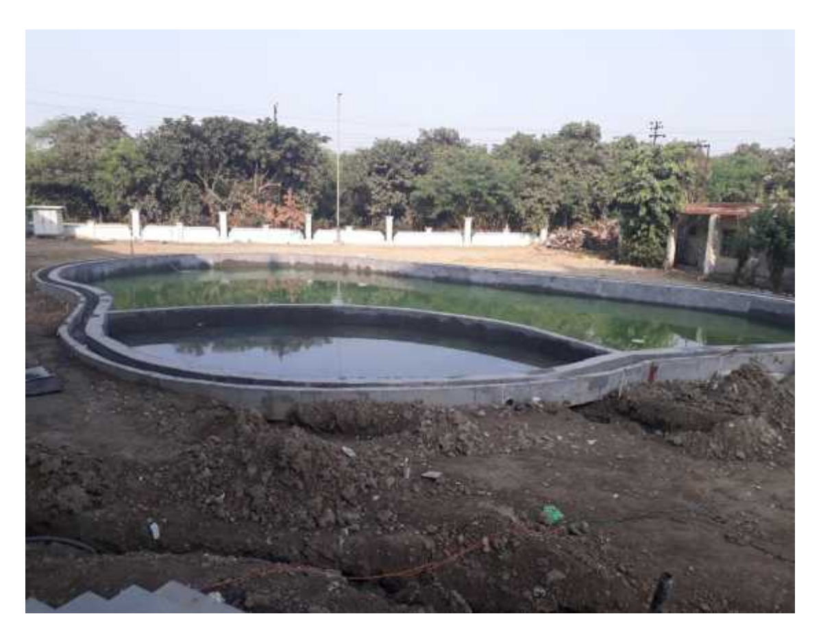
SWIMMING POOL – (OVER ALL COMPLETION = 44.22%)