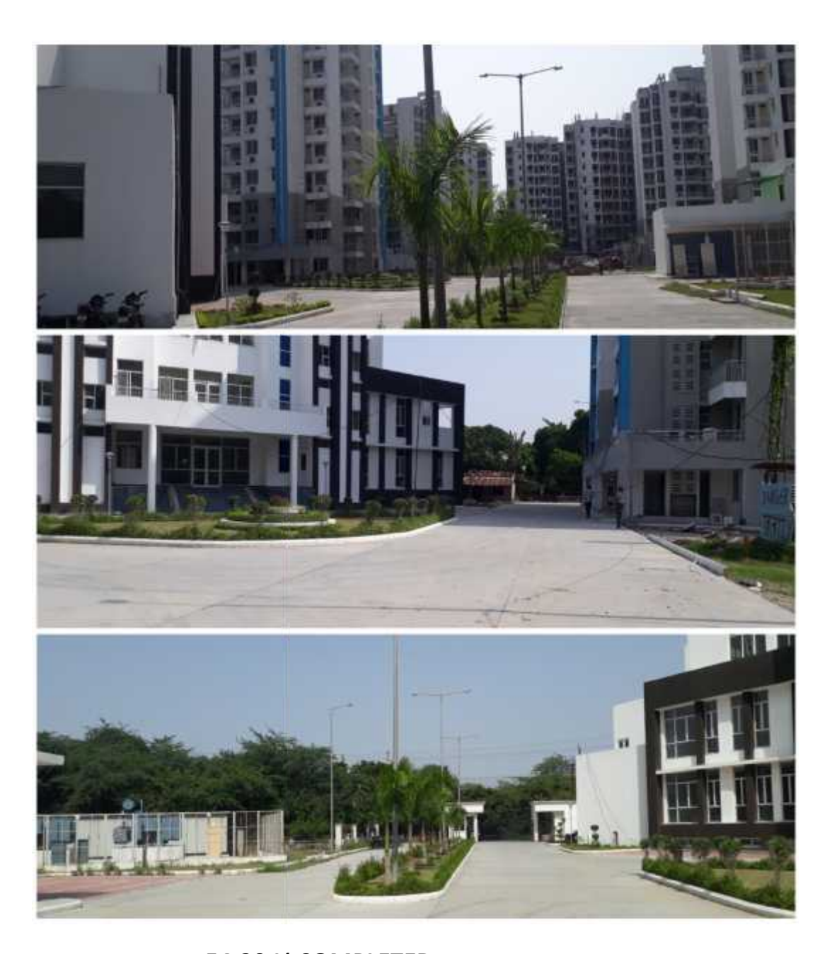
ROAD WORK - 54.20 % COMPLETED.