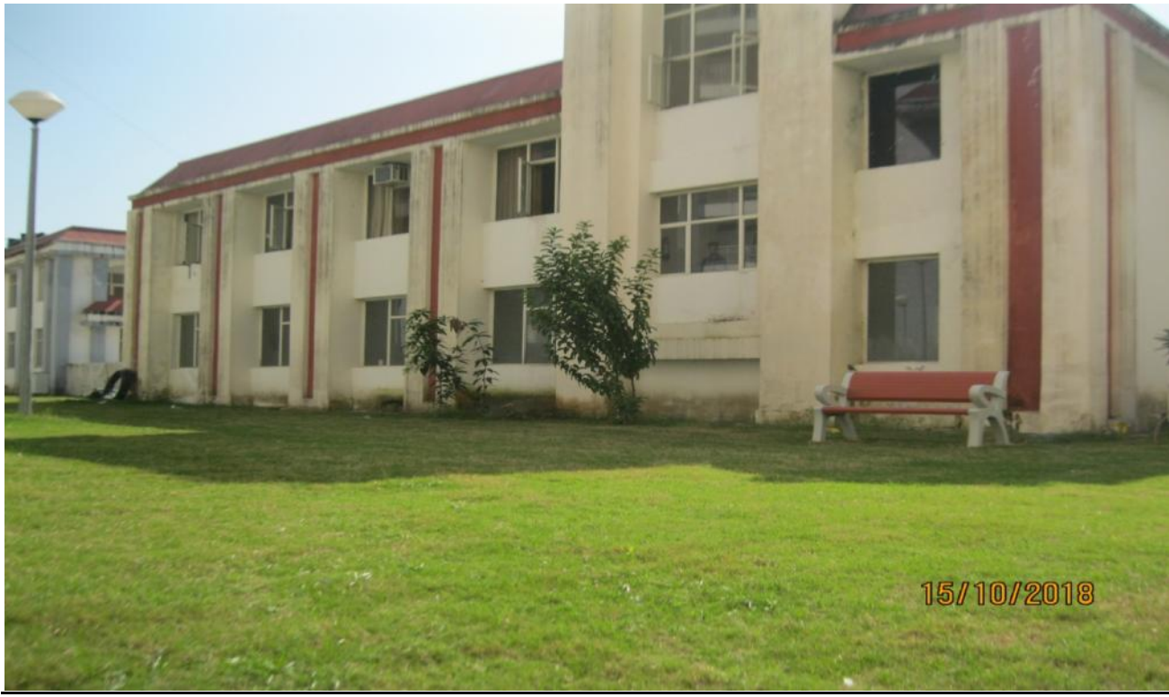
<u>Progress</u>:- Arbotriculture work is in progress. Work of Package-I is completed and handed over to AFNHB.

50% work is completed in Package-II and remaining work is in progress PDC for handing over is 31 Oct 18.