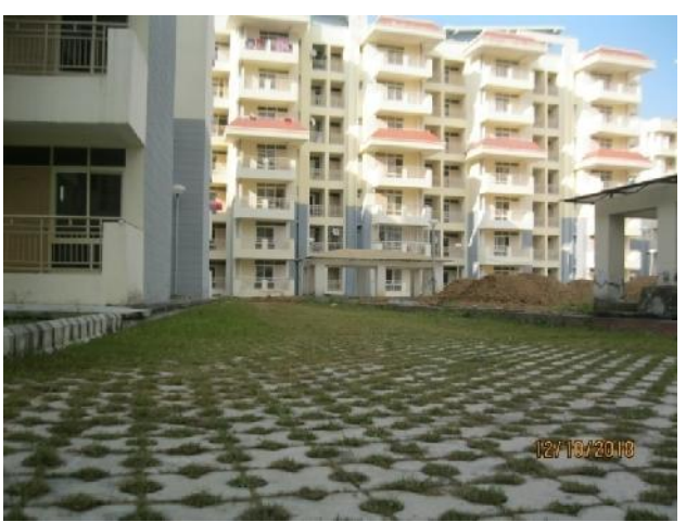
VIEW OF UPPER BASEMENT ROOF TOP DEVELOPMENT WORK