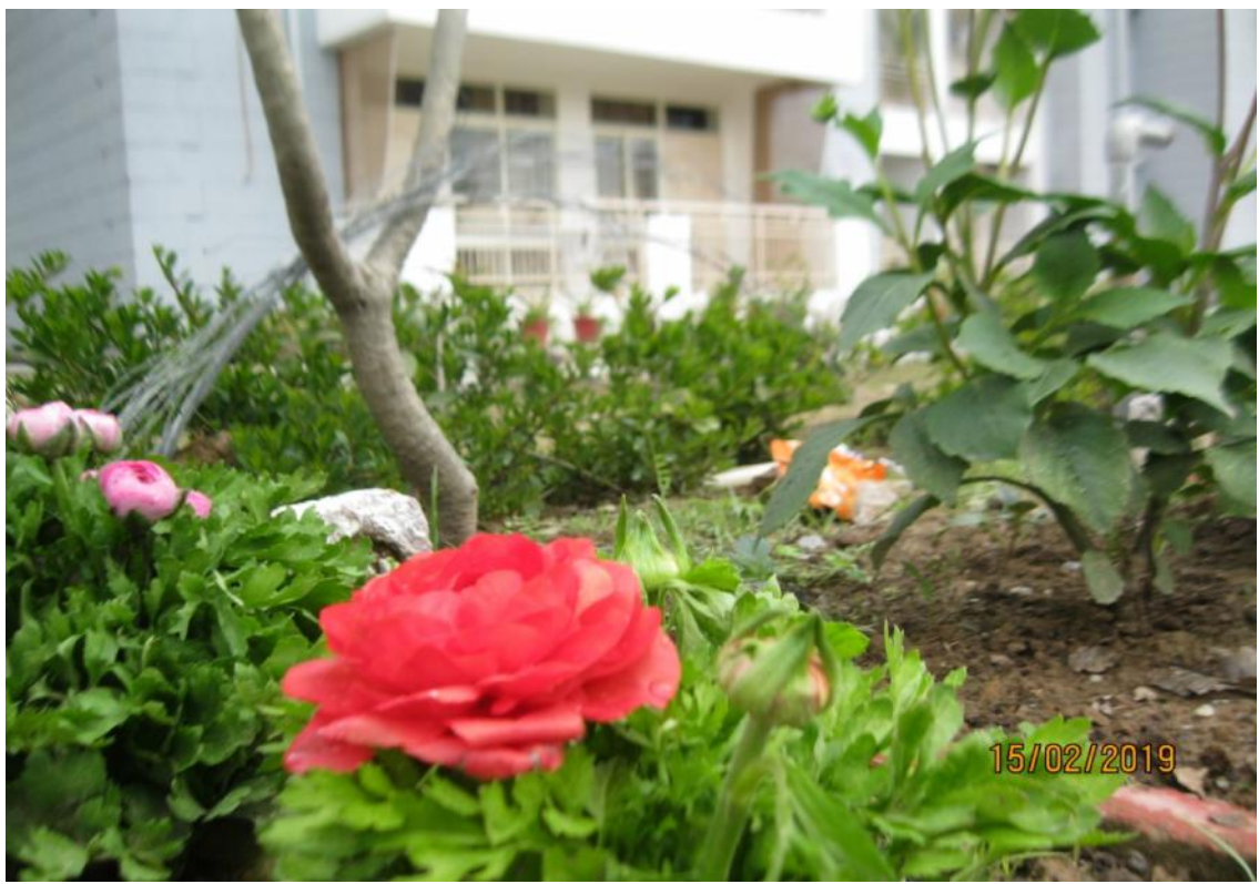
<u>Progress</u>:- Arboriculture work is in progress. Work of Package-I is completed and handed over to AFNHB.

50% work is completed in Package-II and remaining work is in progress PDC for handing over is 28 Feb 19.