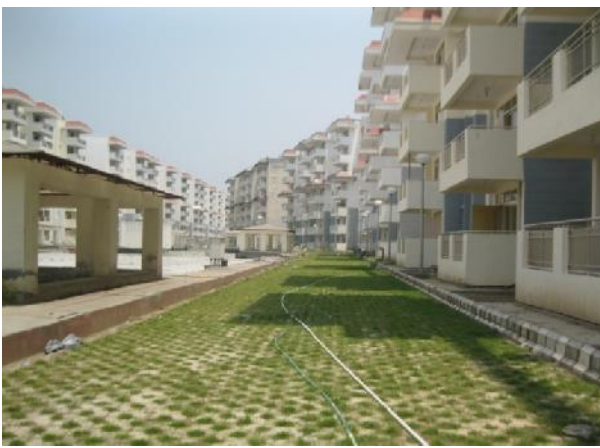
VIEW OF UPPER BASEMENT ROOF TOP DEVELOPMENT WORK