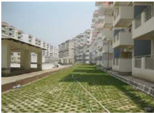
VIEW OF UPPER BASEMENT ROOF TOP DEVELOPMENT WORK