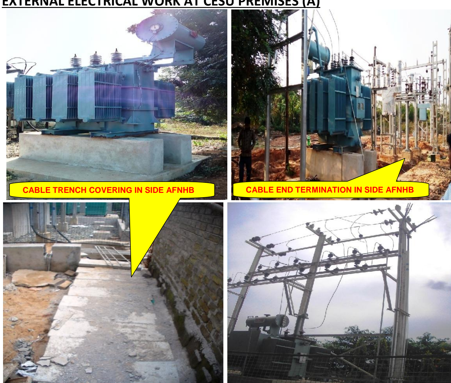
EXTERNAL ELECTRICAL (PART-A) - (Overall completion- 99%)

EXTERNAL ELECTRICAL WORK AT CESU PREMISES (A)