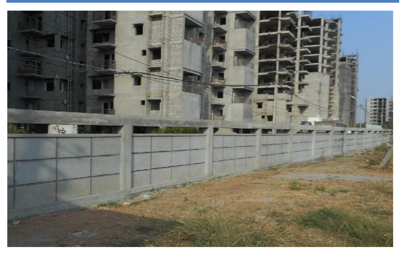
COMPOUND WALL- SOUTH SIDE