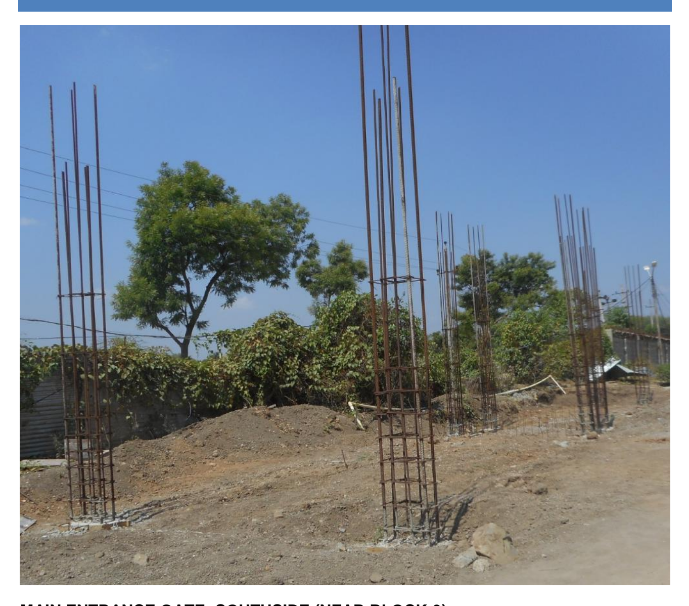
MAIN ENTRANCE GATE- SOUTHSIDE (NEAR BLOCK-3)