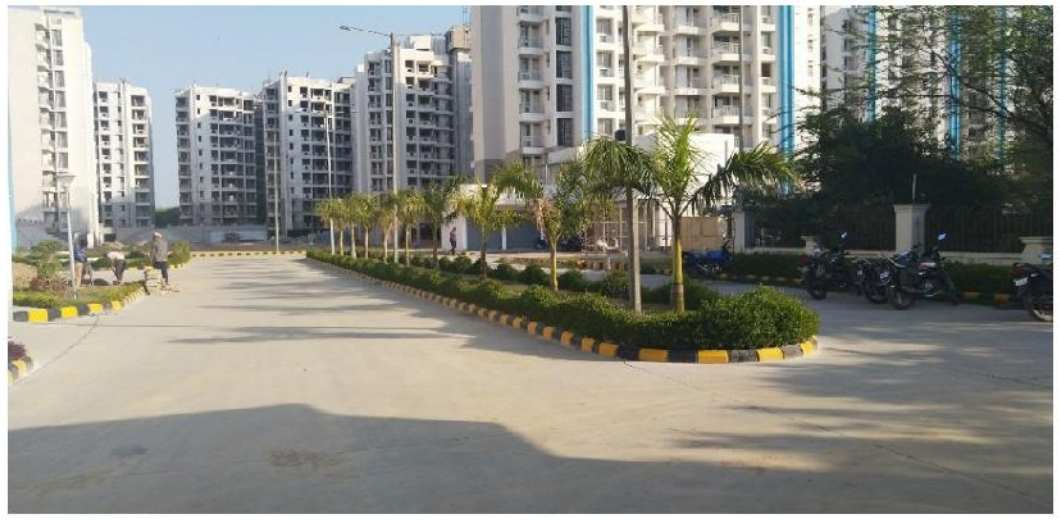
ROAD WORK - 62.29 % COMPLETED.