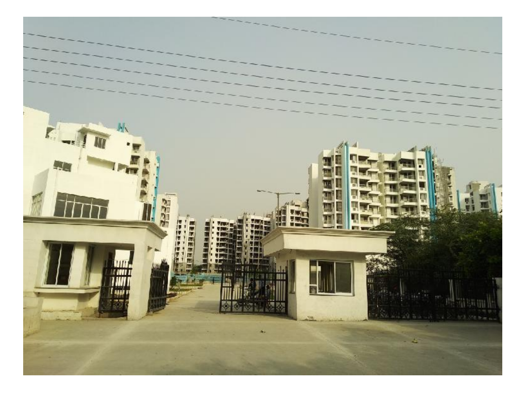
MAIN GATE & BOUNDARY WALL - 80.15 % WORK IS COMPLETED