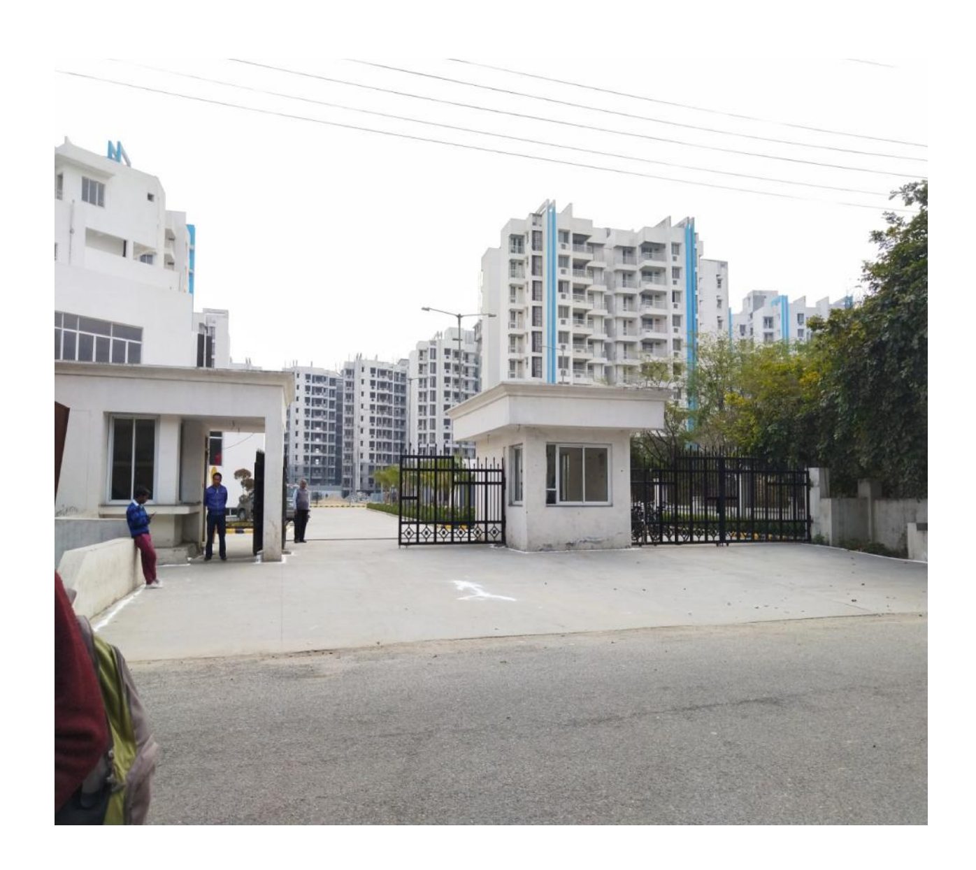
MAIN GATE & BOUNDARY WALL - 80.15 % WORK IS COMPLETED