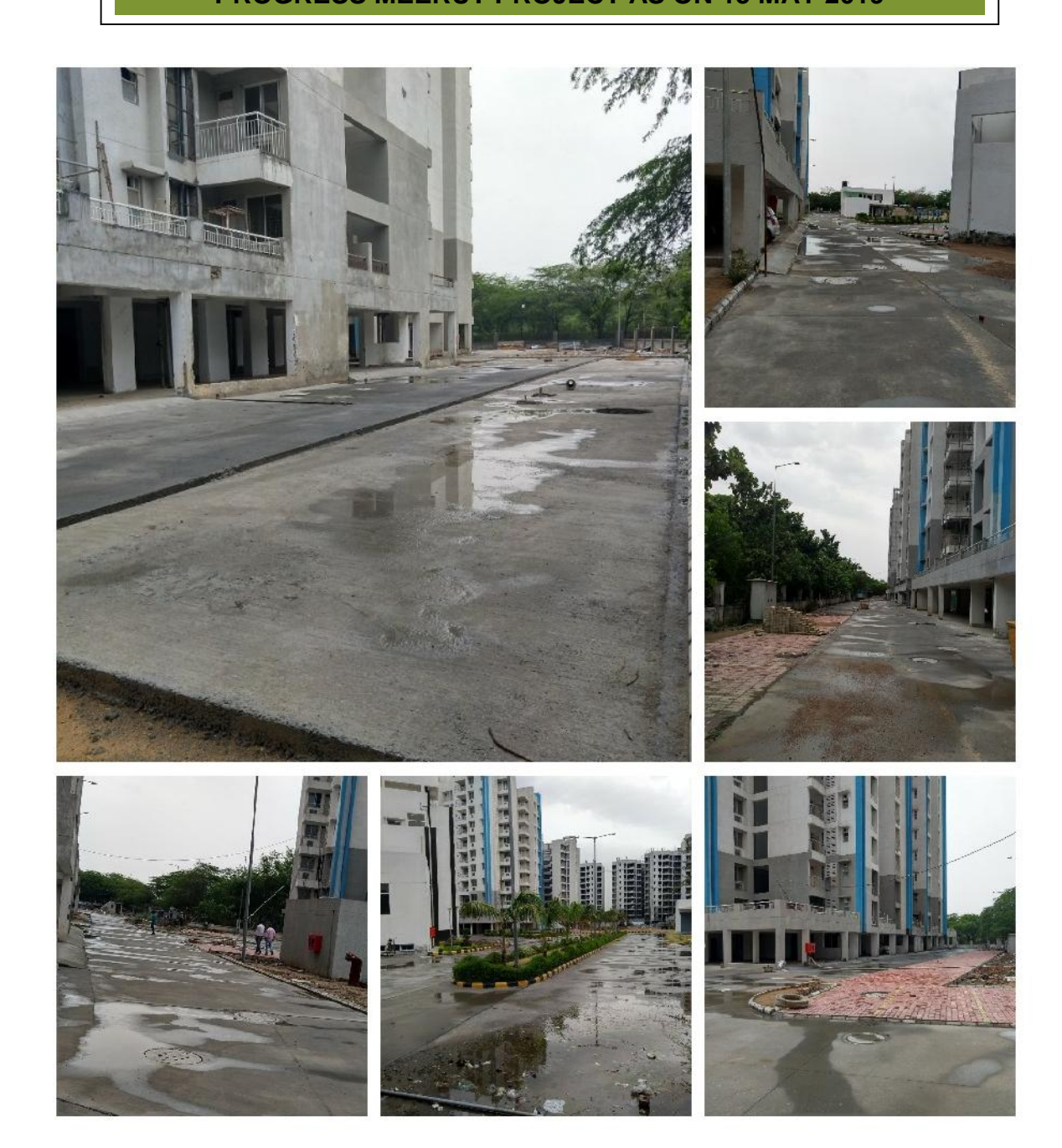
ROAD WORK - 90.00 % COMPLETED.