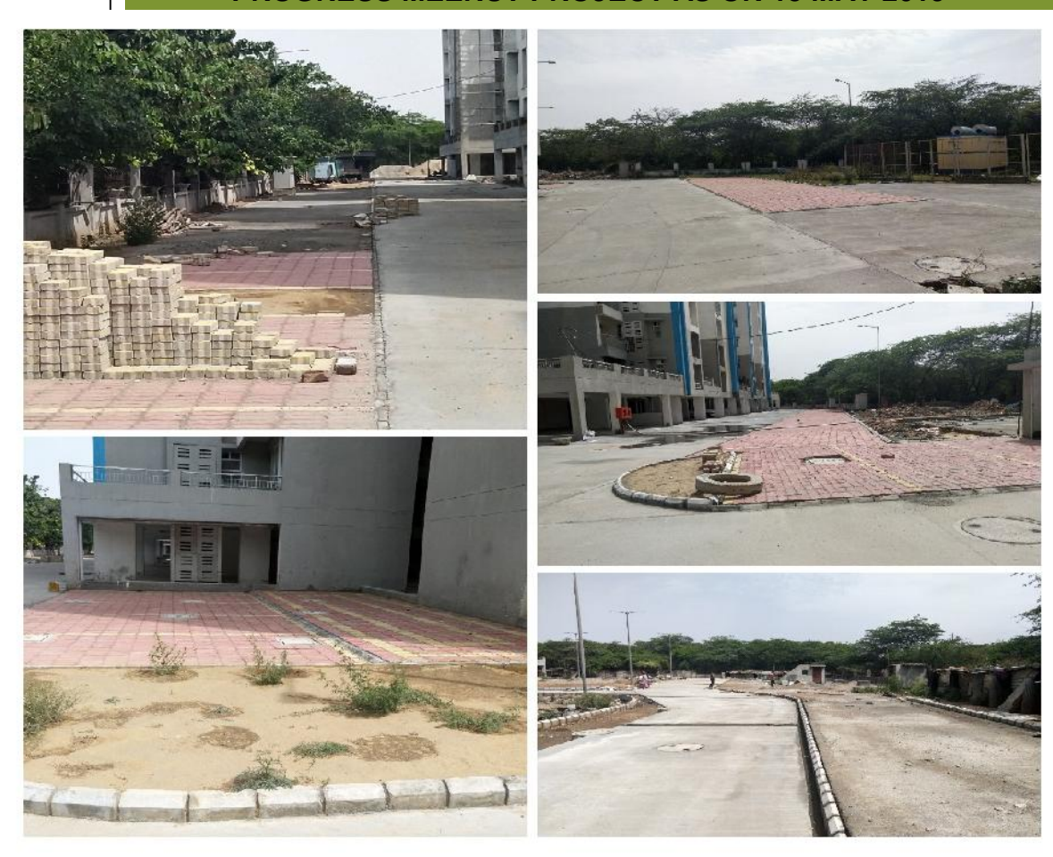
PARKING AREAS - 65.00 % COMPLETED.