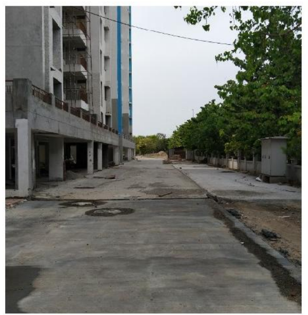
ROAD WORK - 64.14 % COMPLETED.