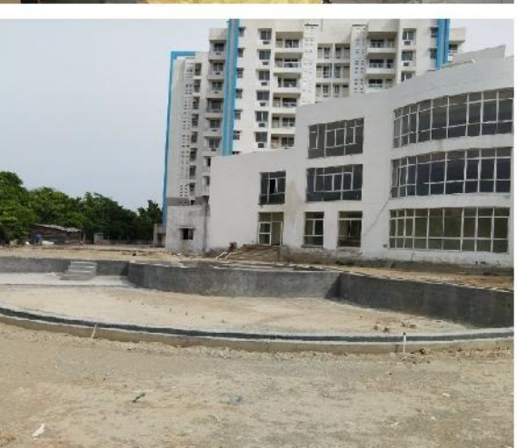
SWIMMING POOL - (OVER ALL COMPLETION = 60.43%)