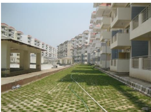
VIEW OF UPPER BASEMENT ROOF TOP DEVELOPMENT WORK