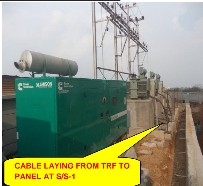
CABLE LAYING FROM TRF TO PANEL AT S/S-1