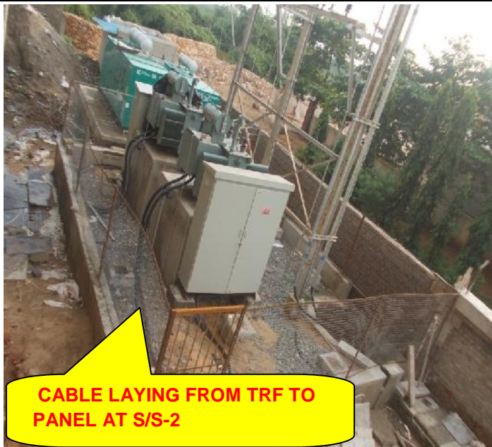
CABLE LAYING FROM TRF TO PANEL AT S/S-2